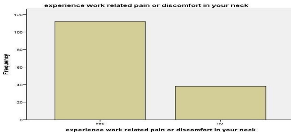
Fig. 3: Experience work related pain or discomfort in your neck.

frequency of not experience work related pain in neck is 38 and percentage is 25.3.